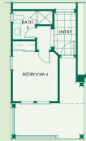
OPTIONAL BEDROOM 4